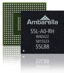
The S5L chip is suitable for professional IP Cameras with up to 4Kp30 video performance

The flexible S5L SDK provides a Linux-based framework and development environment that includes image-tuning tools and a rich set of APIs, enabling a range of product customization and differentiation options in areas such as sensor and lens tuning, analytics and network applications.