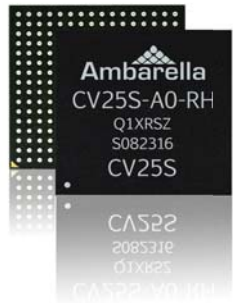
The CV25S chip targets IP camera designs

CV25S includes a suite of advanced security features to implement advanced on-device physical security, including OTP, secure boot, TrustZone ® , and I/O virtualization. A complete set of CVTools is provided to help customers to easily port their own neural networks onto the CV25S SoC.